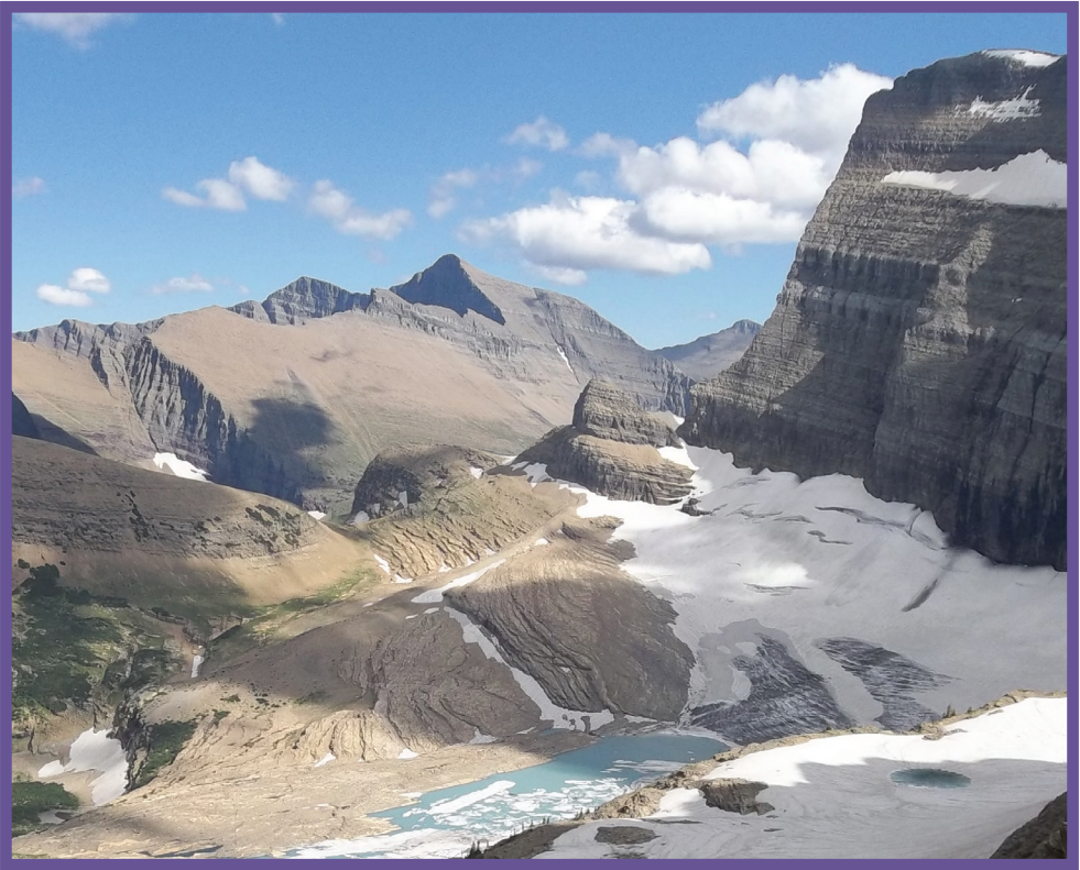
Grinnell Glacier, Glacier National Park