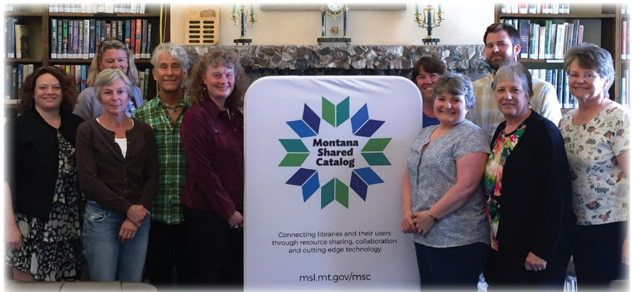
Montana Shared Catalog Executive Committee